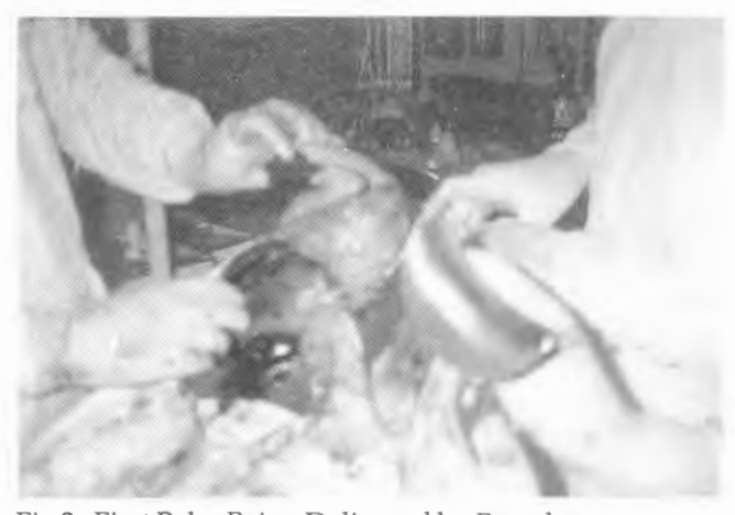
Fig 2: First Baby Being Delivered by Breech

ligament and postero lateral aspect of uterus. The placenta was separated from all the attachments and haemostasis achieved. The abdomen was closed in layers.