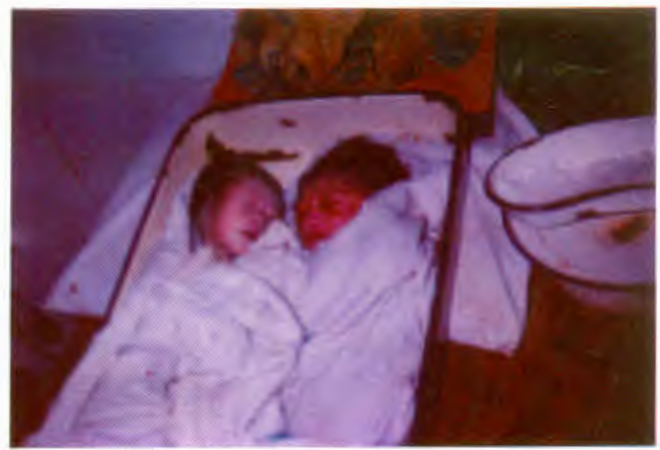
Fig 6: Both the Babies