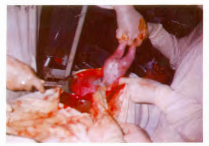
Fig 3: First Baby being Delivered by Breech