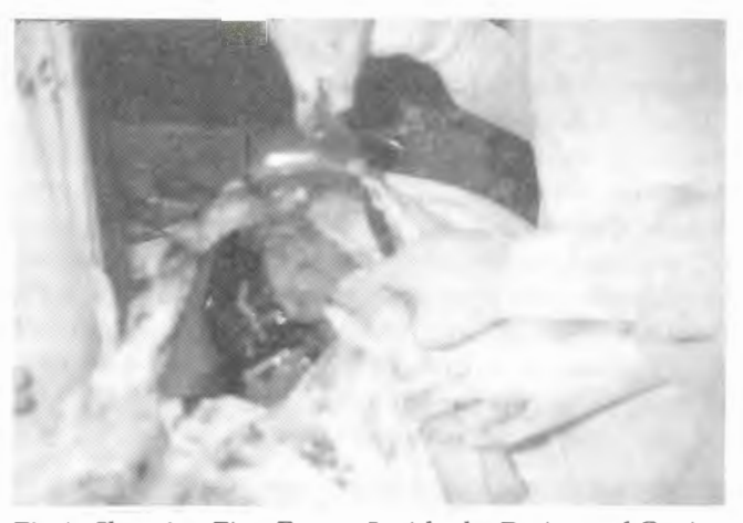
Fig 1: Showing First Foetus Inside the Peritoneal Cavity with the Cord and Intact Uterus

Laparotomy confirmed our suspicion. The first baby was found inside the peritoneal cavity (extra uterine) occupying the epigastrium and left hypochondriac region. The baby was taken out after clamping of the cord. Then the second baby (intra uterine) was delivered by LSCS and the placenta was removed manually which was morbidly adherent. The uterus was repaired in layers. On examination the placenta of the first baby was found to be attached to the omentum, left infundibulopelvic